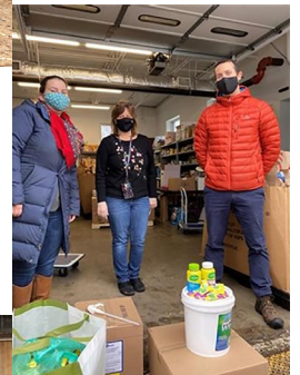
▶ Working with local food bank to help those in need