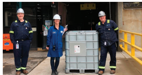
◀ Keeping communities safe and supporting small businesses by donating home-produced hand sanitizer