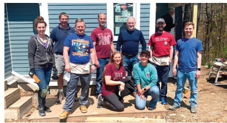
◀ Joining forces with Habitat for Humanity Lowell Chapter to strengthen our community